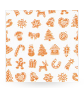
Gingerbread (water decal)