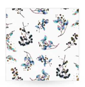
Winter bloom (water decal)

Thanks to our new sticker collections, your nails can become real jewels this winter season. Choose from two self-adhesive sets and three water sticker sets that perfectly align with seasonal trends. The elegant leaf motifs (Winter Bloom, CN-17) are perfect for nature lovers, while classic snowflake patterns (Silver Snow, CN-16) never go out of style. For a playful touch, the gingerbread figures (Gingerbread) add a playful atmosphere to your nails.