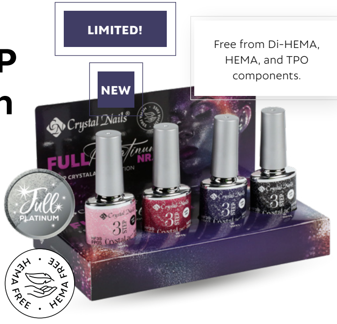
New HF3S FP8 Dark Shadows