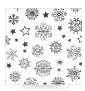
Silver snow (water decal)