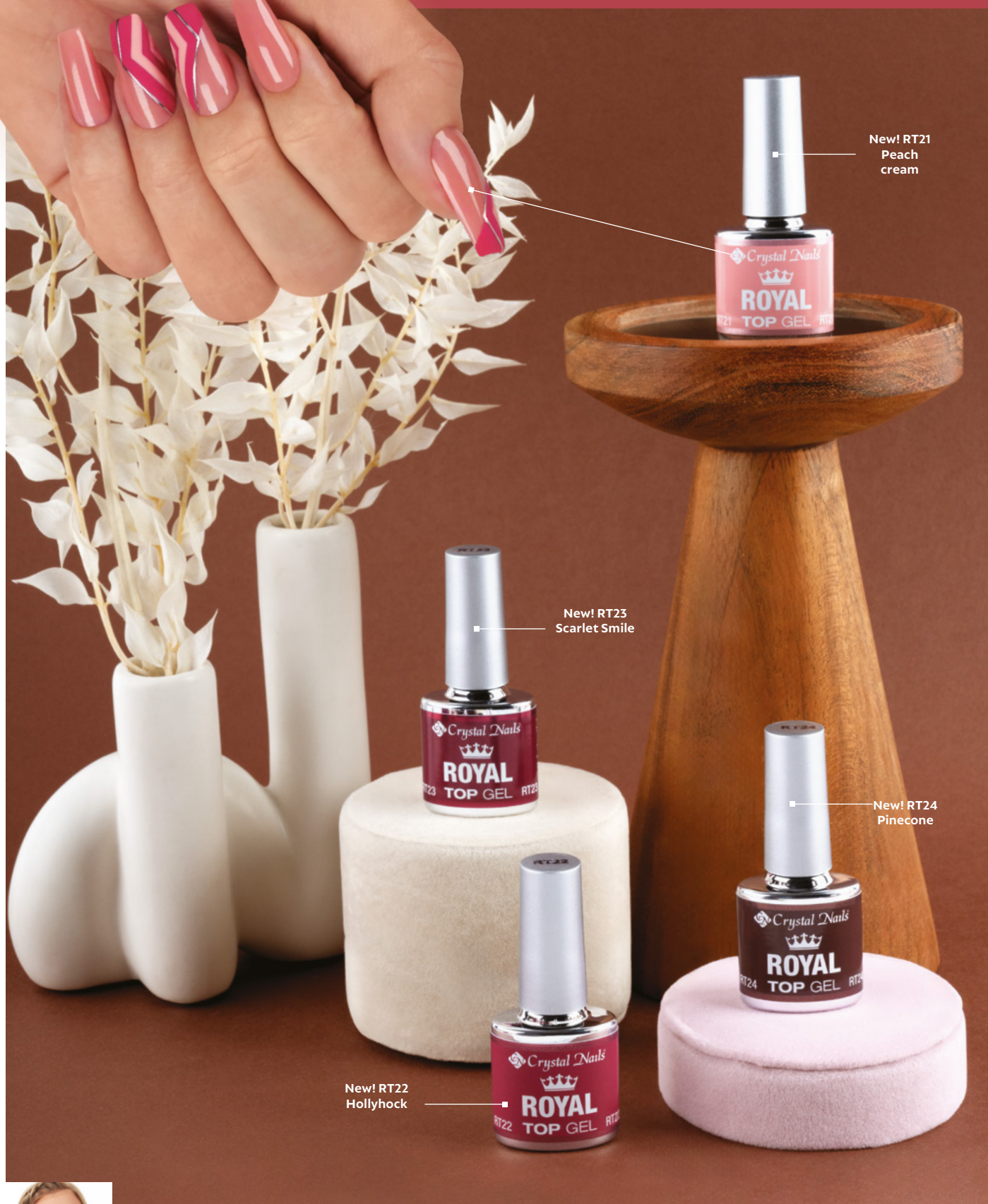
New! RT21 Peach cream

The nail set was made with the NEW! Royal Top Gel RT21 - Peach Cream and the NEW! RT22 - Raspberry Rose, decorated with SENS Metallic decor gel - Mirror Silver (by Edina Sikari).