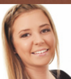
New! RT22 Hollyhock

"The newly launched Royal Tops come in true autumn colors. Every guest is guaranteed to find their favourite, plus they make our salon work easier."