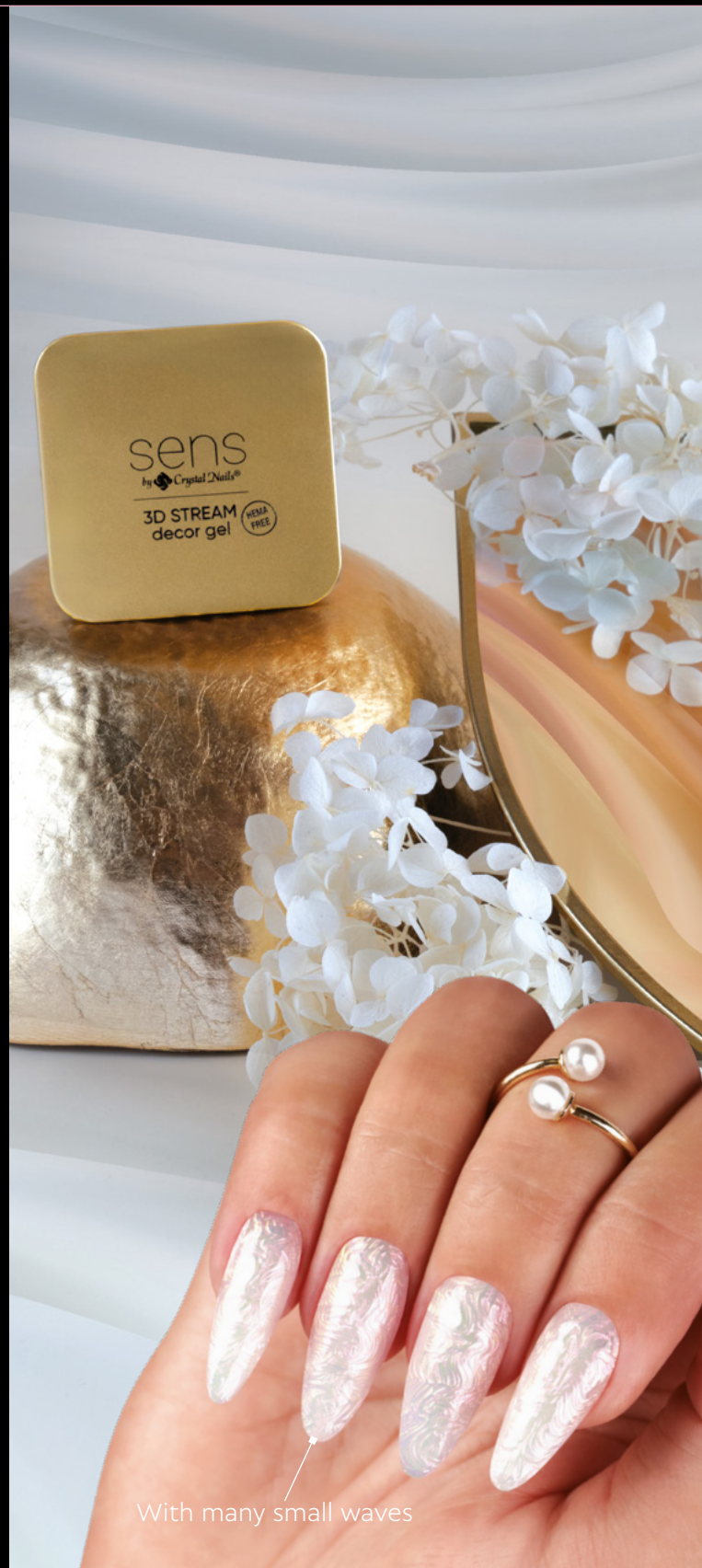
With many small waves

Free of Di-HEMA, HEMA and TPO components.